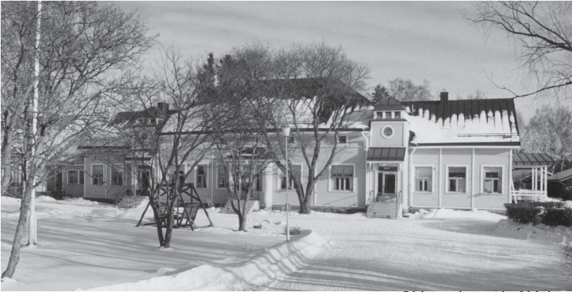
Old-age home in Ahlainen